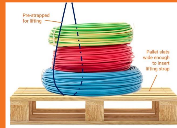
Diagram for illustration purposes only Dashed strap denotes placement within the coil Please ensure boxed and packaged for safe delivery