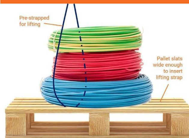
Pre-strapped loose coils

Diagram for illustration purposes only Dashed strap denotes placement within the coil Please ensure boxed and packaged for safe delivery