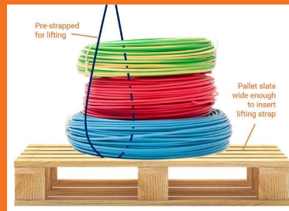
Diagram for illustration purposes only Dashed strap denotes placement within the coil Please ensure boxed and packaged for safe delivery