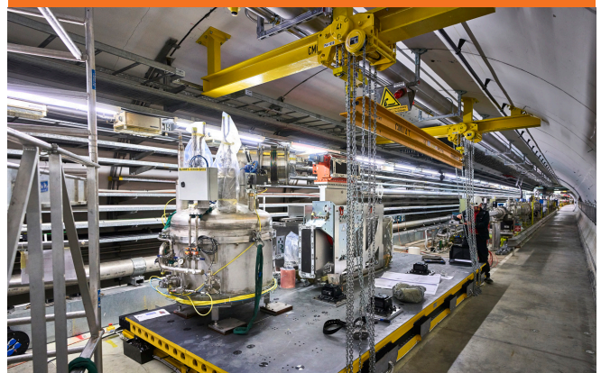
HiLumi LHC Project