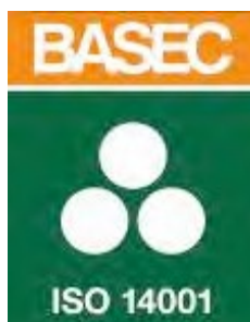
Environmental Management Systems to BS EN ISO 14001